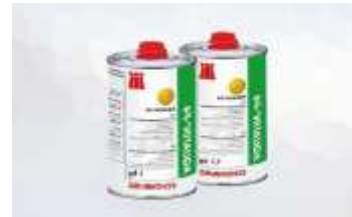
AQUAFIN-P4 Elastic polyurethane injection resin