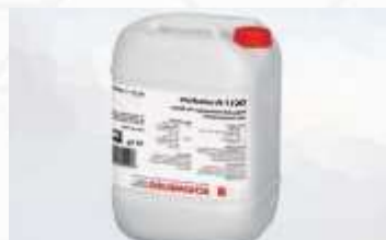
OC17-ANTI FREEZE Speeding up concrete and mortar construction