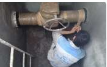
Project on anti-corrosion coating of valves and pipes and sealing of Marand gas ponds Location: East Azerbaijan Province, Marand County Client: East Azarbaijan Gas Company