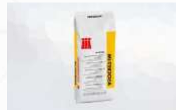
ASOCRETE-IM Reinforced concrete wa- terproofing mortar