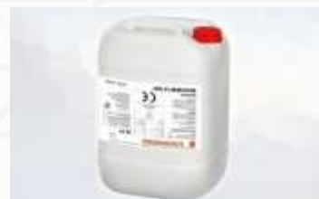
REMICRETE-SP35 Powerful, high performance lubricant