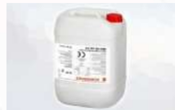
REMICURE-CR Additives for concrete making