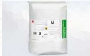
ASOCRETE-GM100 Coarse-grained restorative mortar