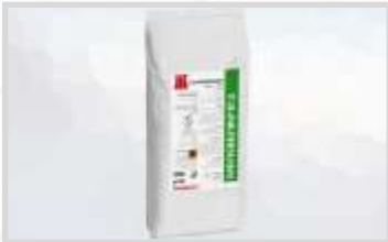
INDUCRETE-BIS 0/2 Anti-corrosion mineral mortar and primer