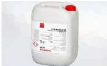
BETOCRETE-C16 Crystalline sealant additive