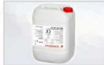
REMICURE-RB Resin-based curing for newly executed concrete