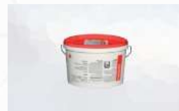
SANIFLEX Elastic sealant