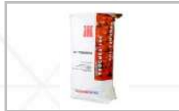
ASOCRETE-105 Fine-grained restorative mortar