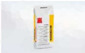
ASOCRETE-130 Concrete Restoration Mortar