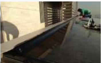
Project of protective coating of facade and sealing of green roofs and enclosures and seating of hotel Accommodation Alvand Location: Tehran, Argentina Square Client: khatereh Khosh Hotel Construction Company