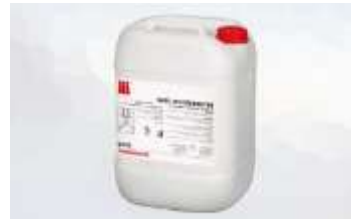
BETOCRETE-C21 Third Generation Additive, Water Reducer, Crystal Sealant