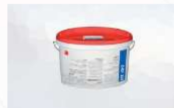
FIX10-S Instant sealant