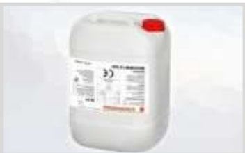
BETOCRETE-G3000 Ultra-lubricant, strong water-retardant and retardant additive for use with pozzolanic materials