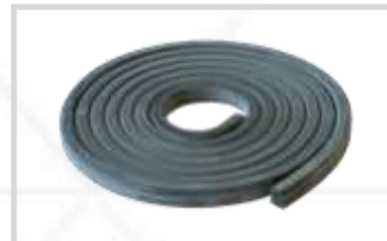
AQUAFIN-CJ3/4 Bentonite Water Stop