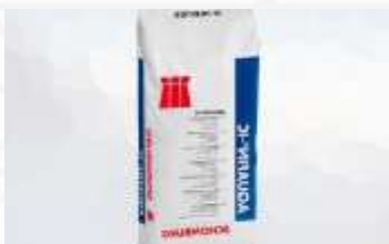
AQUAFIN-IC Mortar sealant and crystalline sealant