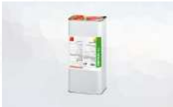
AQUAFIN-P1 Single component polyurethane injector