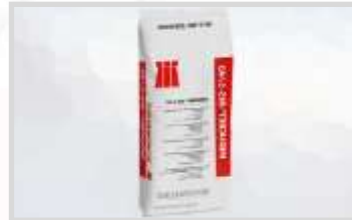
INDUCRETE-BIS 5/40 Soft restorative mortar