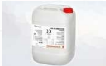
REMICRETE-G650 High performance ultra-long lasting lubricant