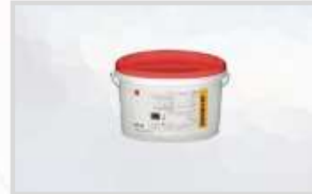
ASOCRETE-RS Appropriate restoration mortar for interior and exterior surfaces