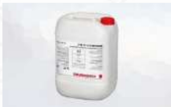
BETOCRETE-C18 Crystalline sealant additive with super-lubricating and retarding properties of concrete