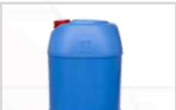
ASOTOP-100 Quartz hard concrete flooring