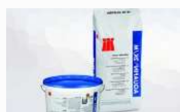
AQUAFIN-2K/M Elastomeric and flexible sealing material