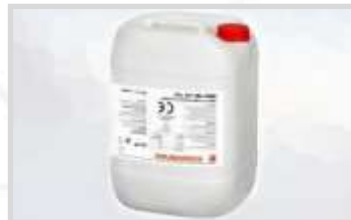
REMI-AIR (LP) Bubble concrete maker