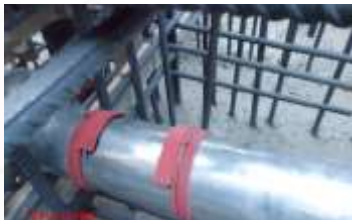
Project of sealing twin large water tanks of Mehdi Clinic Hospital Location: Tohid Square, Tehran Client: Behsara Utility Construction Company