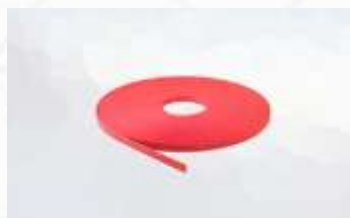
AQUAFIN-CJ6(CJ13) Expandable Thermo-plastic Expandable Hydrophilic