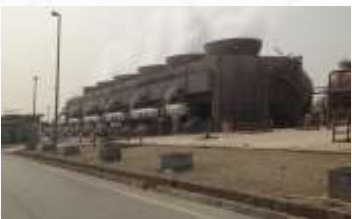
Amir Kabir Petrochemical Cooling Tower Sealing System Location: Khuzestan Province, Mahshahr Port Client: Southern Protective Coatings Company