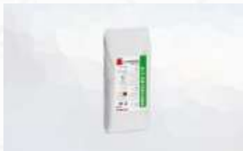
INDUCRETE-BIS 1/6 Soft restorative mortar