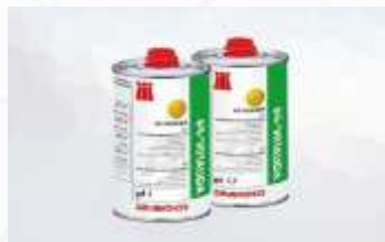
AQUAFIN-P4ME Elastic polyurethane injection resin