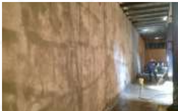
Sealing project of drinking water tank and pit lifts of Moheb Yas Hospital Location: Tehran, North Villa Client: Taban Shahr Construction and Installation Company