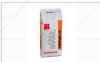
AQUAFIN-1K Sealant mortar