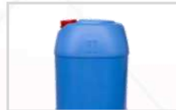
ASOTOP-200 Quartz hard concrete flooring